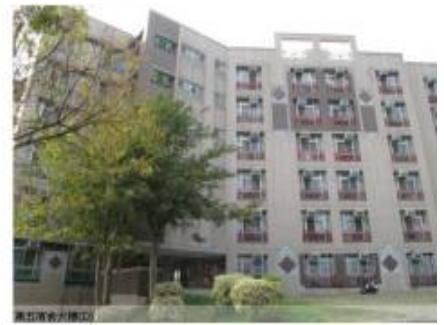
宿舍照片 Photos of DYU Dorms