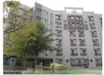
宿舍照片 Photos of DYU Dorms