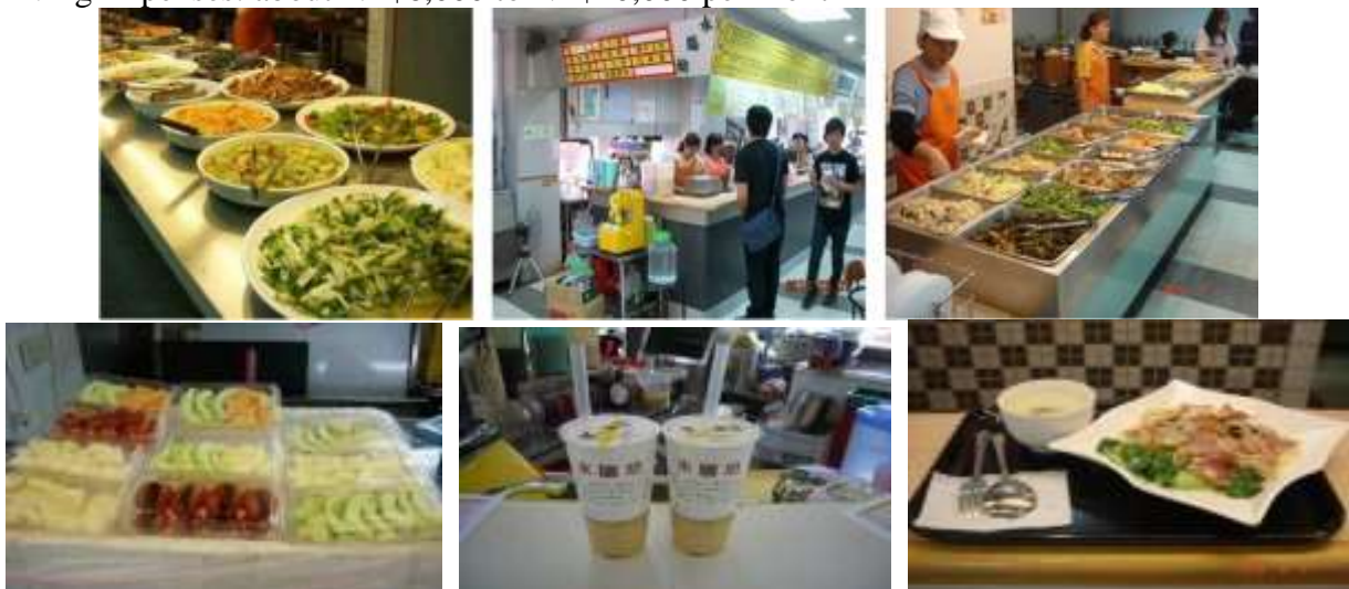
餐廳照片 Photos of Restaurants in DYU

Living Expenses: about NT$6,000 to NT$10,000 per month